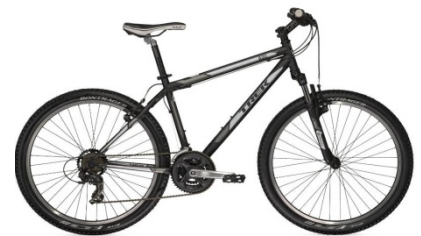
Latest Trek Bike Models