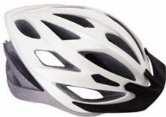
Bike Safety Equipment

Support & Aftersales : IPA facilitates manufacturer warranty coverage and provides replacement bike spares / accessories. Through our years of experience, IPA provides spare parts to meet the needs of aging fleets, as well as recommends new models when Posts are ready to upgrade.