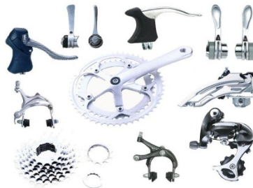
Spare Parts & Accessories